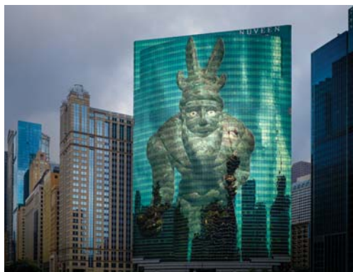
02-Culture - Then and Now.jpg