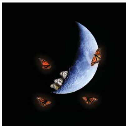
03-Monarch Butterflies Visit Waxing Crescent Moon.jpg